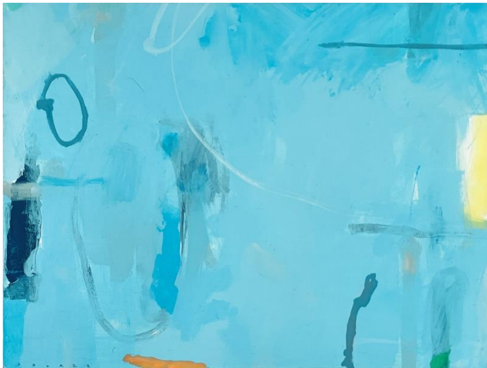
'Bluey'; acrylic on board, 32x24cm, framed, $450