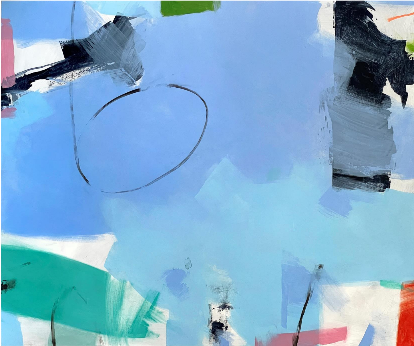
'Azure Coast'; acrylic on board, 120x100cm, framed, $2,500