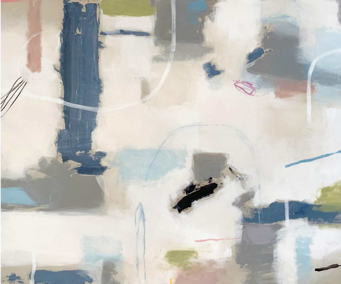
'Implied Landscape'; acrylic on board, 120x100cm, framed, $2,500