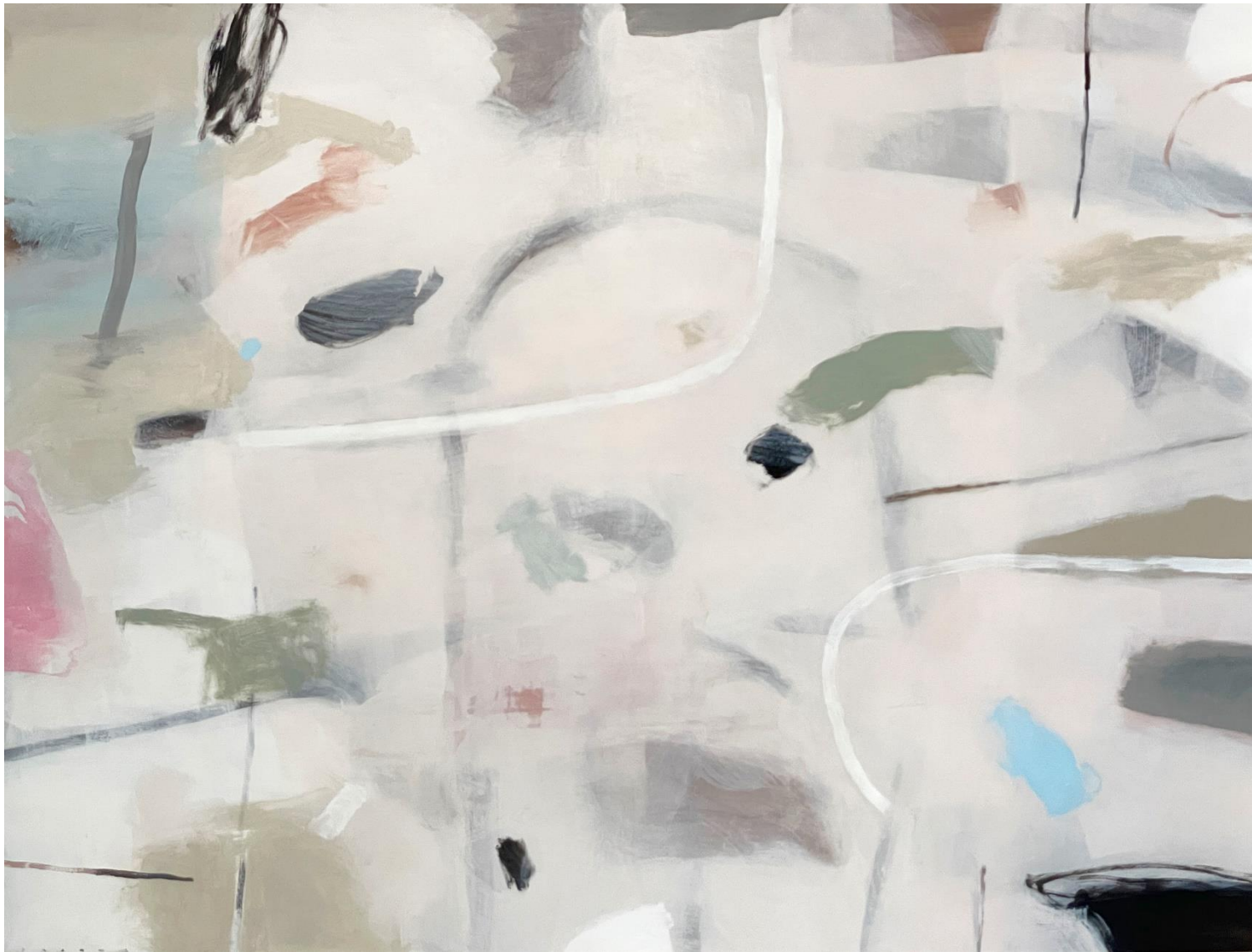
'Lost in the Wilderness'; acrylic on board, 120x90cm, framed, $2,400