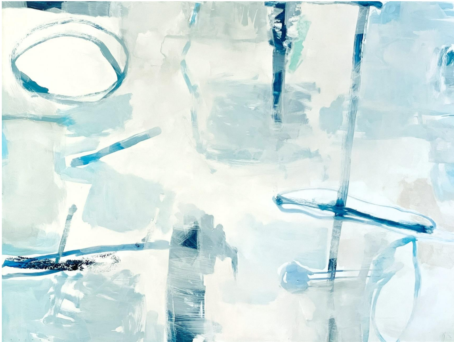
'Immersion'; acrylic on board, 120x90cm, framed, $2,400