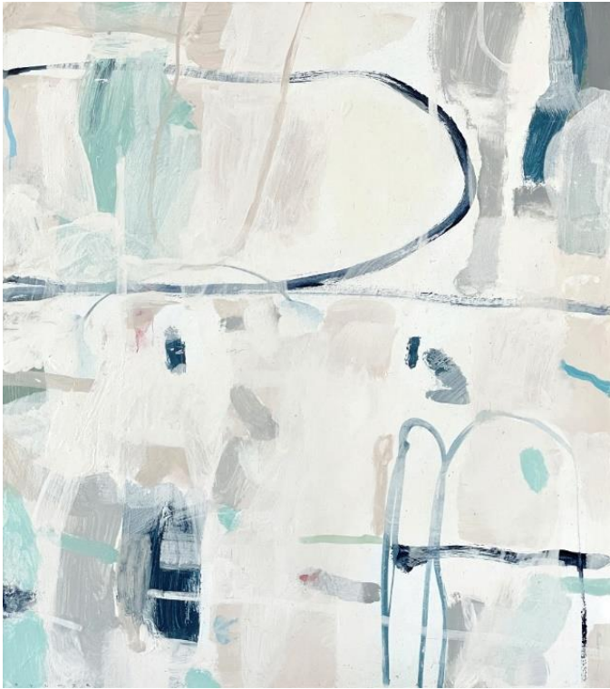
'Freeform' ; acrylic on board, 32x36cm, framed, $550