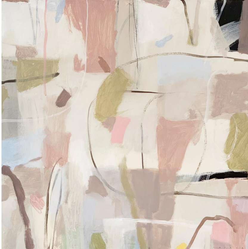
'Trekking'; acrylic on board, 55x55cm, framed, $950