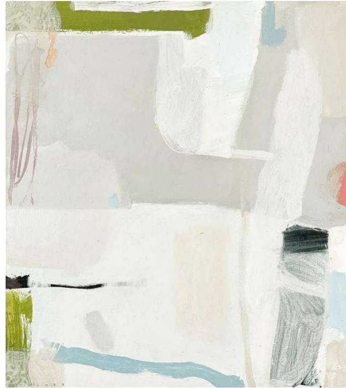
'Field of Play' ; acrylic on board, 32x36cm, framed, $550