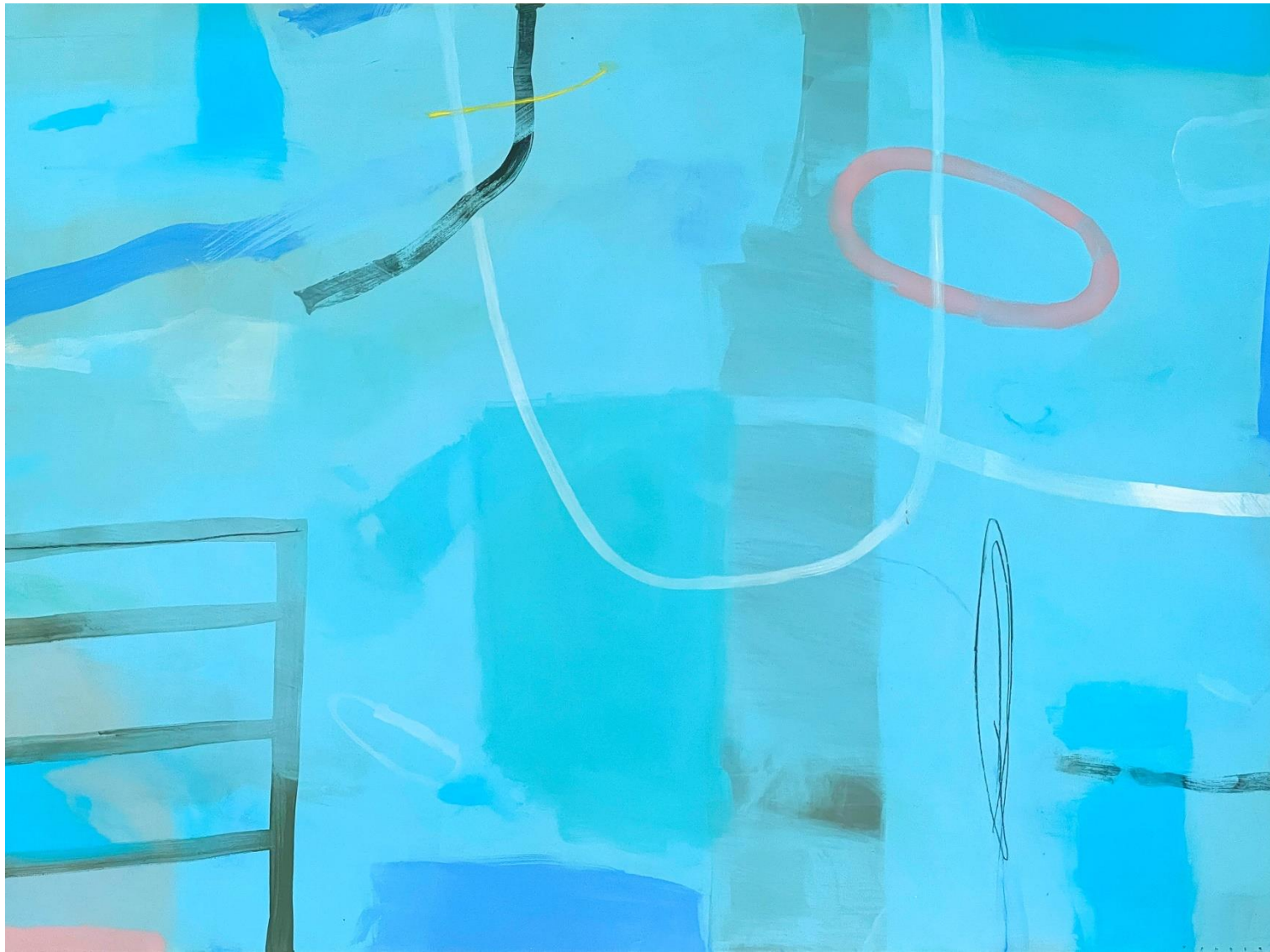
'Swimming off the Pier'; acrylic on board, 120x90cm, framed, $2,400