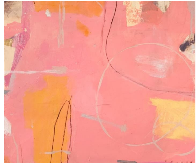
'Pink Pond'; acrylic on board, 30x25cm, framed, $450