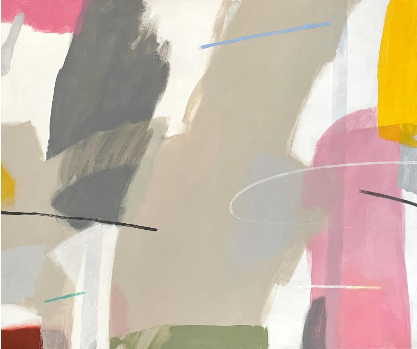
'Mixed Emotions'; acrylic on board, 120x100cm, framed, $2,500