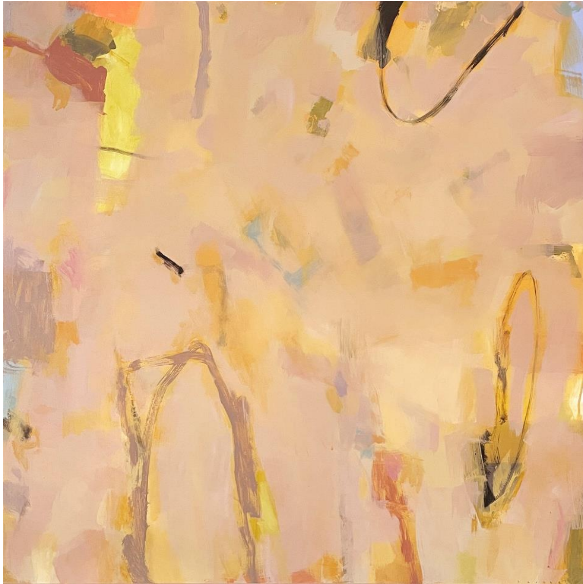
'Central Country'; acrylic on board, 90x90cm, framed, $2,200