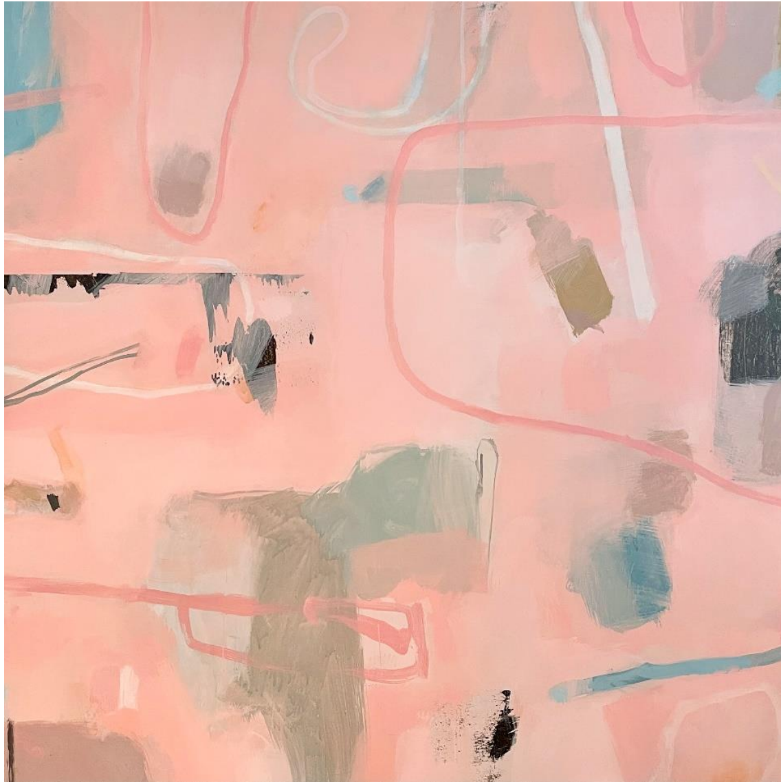
'Making Tracks'; Acrylic on board, 90x90cm, framed, $2,200