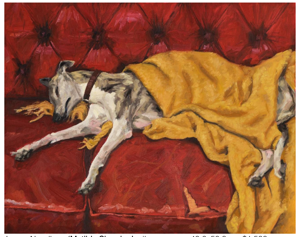
James Needham 'Matilda Sleeping'; oil on canvas, 40.6x50.8cm, $1,500