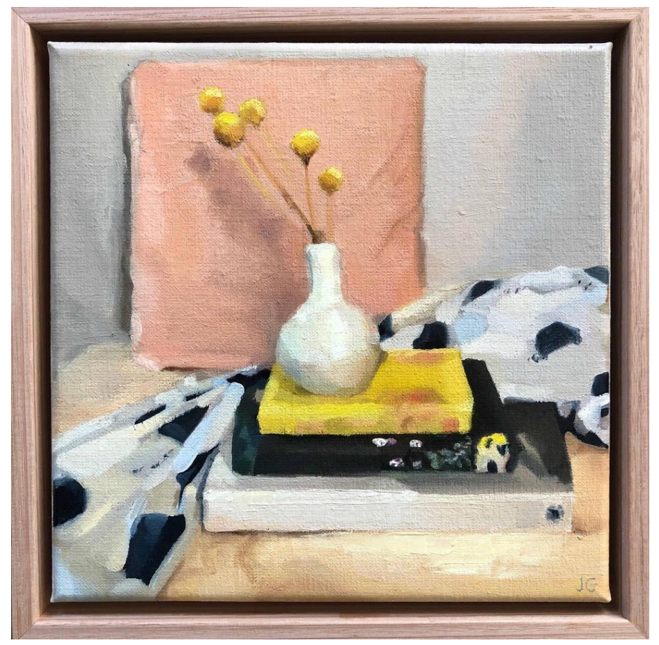
Jessica Guthrie 'Moments of Mindfulness'; oil on linen, oak framed, 28.5x28.5cm, $650