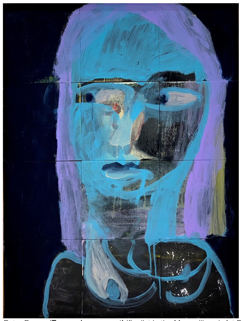
Peter Berner 'Forever in your past' (finalist in the Muswellbrook Art Prise); acrylic on wooden panels, 62x82cm framed, $2,390