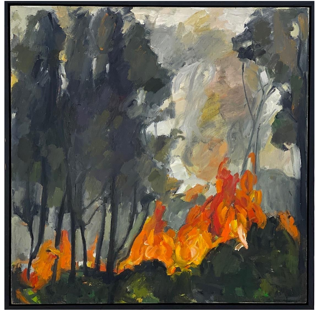
Kate Hopkinson-Pointer 'Back Burn'; oil on board, 50x50cm framed, $1,200