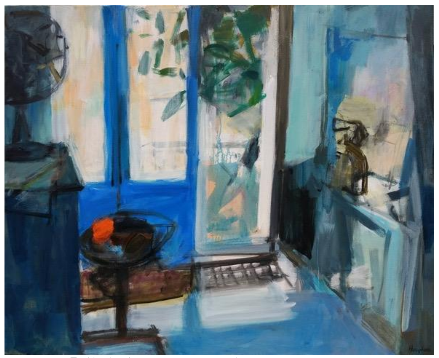
Ingrid Haydon 'The blue doors'; oil on canvas, 110x90cm, $5,500