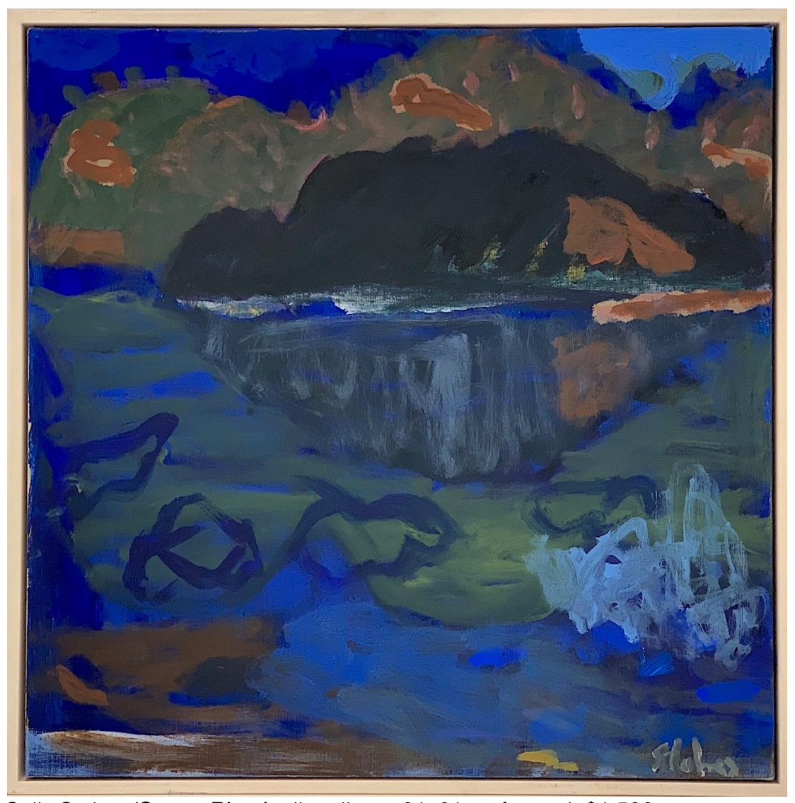
Sally Stokes 'Secret River'; oil on linen, 61x61cm framed, $1,500