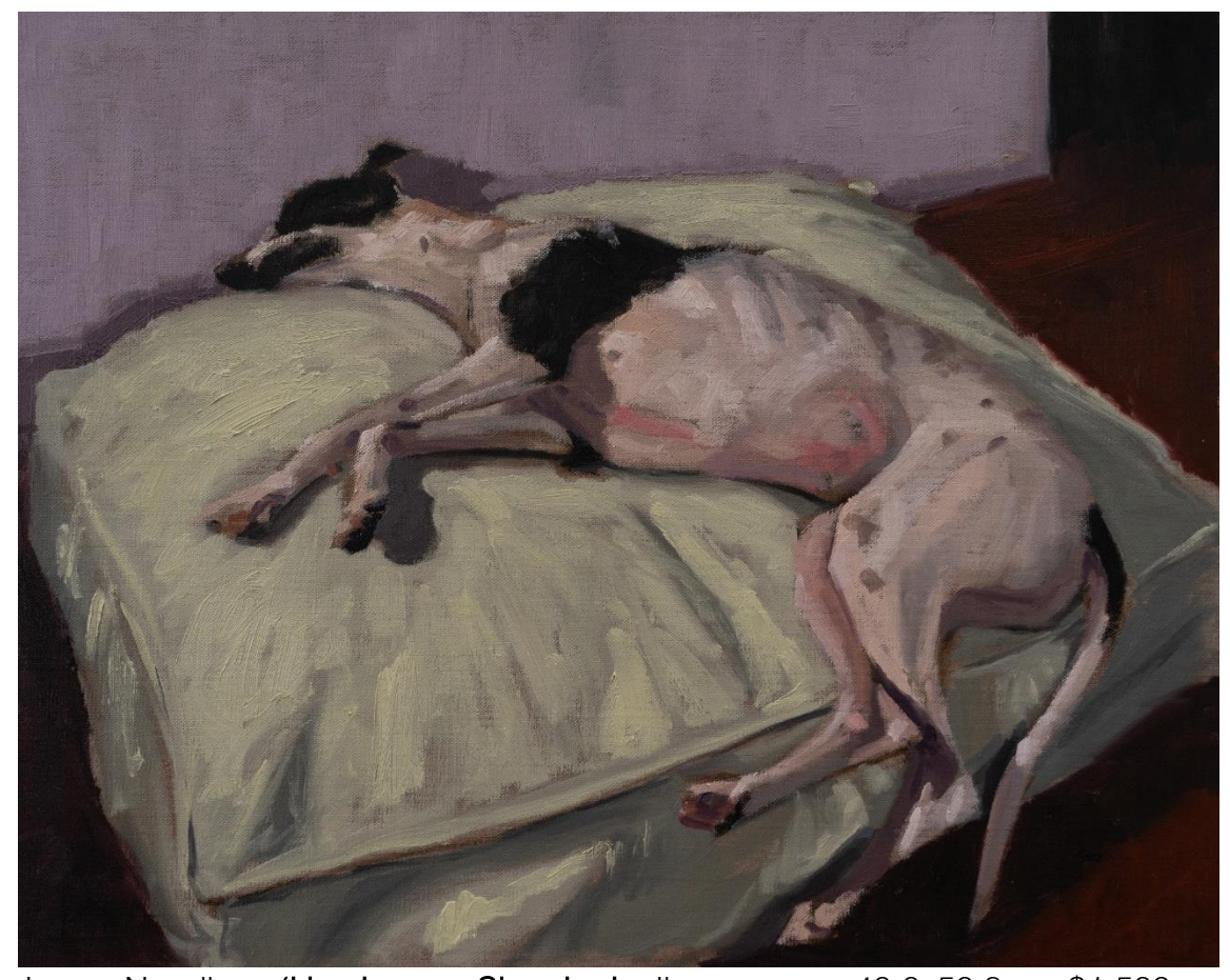
James Needham 'Hemingway Sleeping'; oil on canvas, 40.6x50.8cm, $1,500