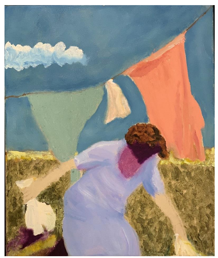
Kevin Low 'Fine day'; oil on canvas 30.5x25.5cm framed, $1,290