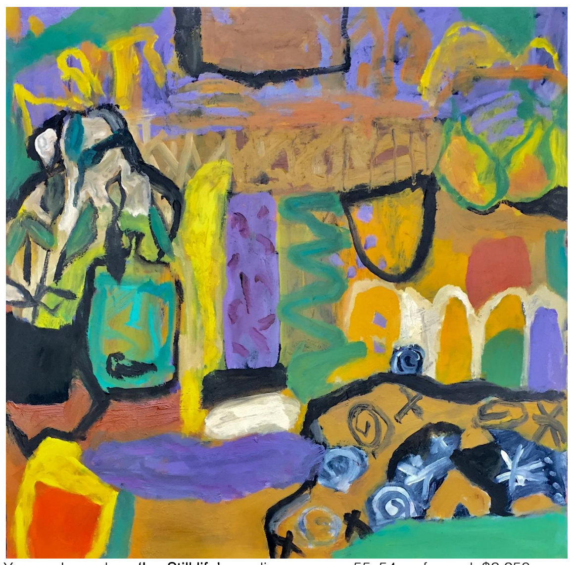
Yvonne Langshaw 'Iso Still life'; acrylic on paper, 55x54cm framed, $2,250